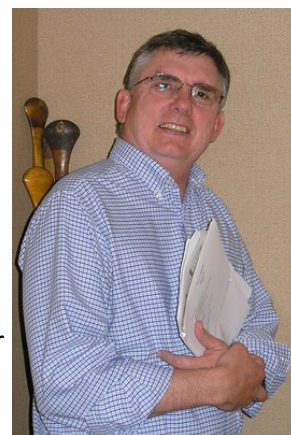
Guess what year?

I will be stepping down as President of the Alumni Association during the Reunion and a new President will be voted on during the Annual Meeting of Alumni held on Saturday morning of the Reunion. It has been a pleasure serving the Association for the past year and I am confident that the Alumni Association is in a position to continue its role of supporting the Ranger School and providing a variety of services to our Alumni! Thanks to all who have pitched in over the past year to help keep our Association functioning at the highest level!