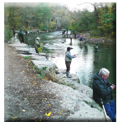
Anglers intensively fish the Eighteenmile Creek Area of Concern.

This project proposes to design and carry out an angler survey that is intended to: analyze angler awareness of the Eighteenmile Creek fish consumption advisory; assess the need for fish consumption advisory signage; identify better pathways of communicating consumption advisories. A fish consumption advisory of, "Eat no amount of any species at any time," currently exists because of Polychlorinated Biphenyls (PCBs) and dioxins found in fish flesh. Due to the severity of the advisory and the popularity of Eighteenmile Creek's Fisherman's Park as a sport fishing destination, there is increasing