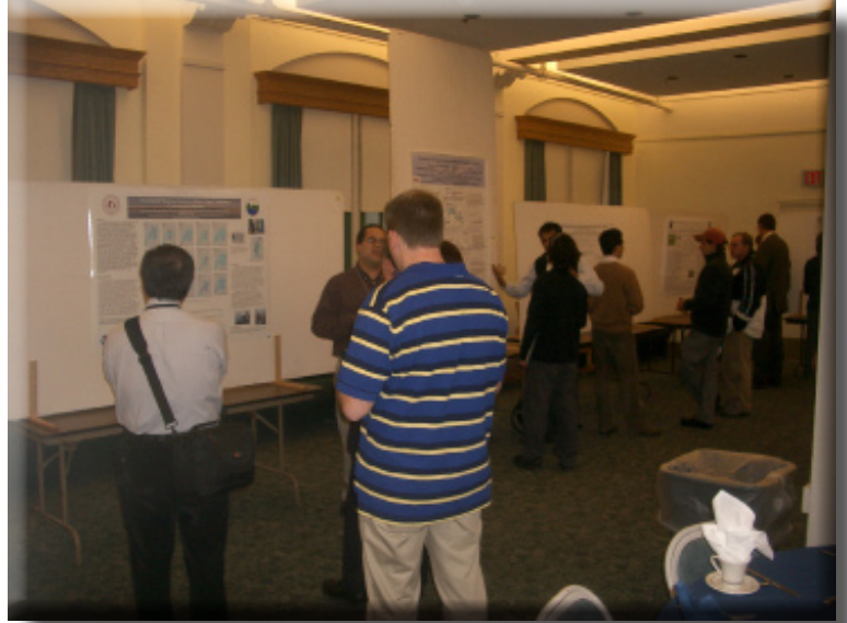
11 students presented their research at the 17th Annual Student/Faculty Conference in March, 2008..

Students and Faculty conducting research in and around the Great Lakes once again came together for the GLRC's annual conference held during the third week of March at SUNY-ESF in Syracuse. For the past two years we have had over 90 people in attendance with roughly 40 student presenters each year. Each year we begin the conference with a panel discussion, bringing in speakers from as far away as Texas. Last year's panel discussion was titled "Great Lakes Observing Systems" and this year our panel focused on the Great Lakes in a Changing Climate. Concurrent student presentation sessions in both years included such topics as Limnology, Fisheries, Environmental Engineering, Chemistry, Social Science and Policy. A poster session was held before Friday's banquet where students presented their work to conference attendees. Awards for each of the sessions are given at Saturday's lunch and a $100 prize to each of six students receiving awards is made possible by New York Sea Grant. See you at next year's conference!