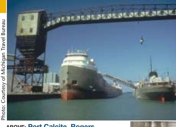
ABOVE: Port Calcite, Rogers City, MI. RIGHT: East Grand Forks, MN, 1997.

ountless small communities and major cities such as Chicago, Detroit, and Toronto are situated on the shores of the Great Lakes. Sewage and run-off, especially during heavy downpours, can overwhelm outdated water infrastructure and contaminate streams and lakes. Moreover, the region's economy is large and diversified, and freighters ply the lakes and seaway corridors to the Atlantic Ocean carrying goods and commodities worth billions of dollars. All of these activities rely on water for drinking, irrigation, industrial processes, and shipping. In the process, communities and industries can and do pollute and overdraw both surface and groundwater.