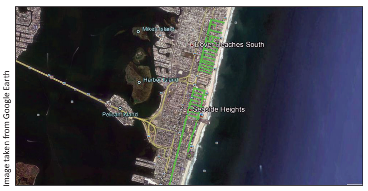
The team scanned more than 80 miles of coastal communities, including New Jersey's barrier islands such as Seaside Heights (shown in green).

Rutgers' Center for Advanced Infrastructure and Transportation (CAIT), a U.S. Department of Transportation Tier I University Transportation Center, recognized the unique opportunity provided by Hurricane Sandy to learn from and quantify the disastrous effects of a major storm and use that data to help communities prepare for and recover from future extreme weather events.