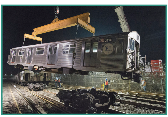
▲ Transporting subway cars to the Rockaways.

The MTA was committed to getting the entire system running again, and not just focused on Manhattan. This is highlighted by a valiant effort to restore subway service to the Rockaways. Hundreds of feet of track and the signal system along the Broad Channel Bridge were permanently damaged. On Sunday, November 11, the A train was extended to Howard Beach, and a free shuttle bus was set up between the Howard Beach station and Far Rockaway / Mott Avenue. The MTA, however, says that it will be months before subway