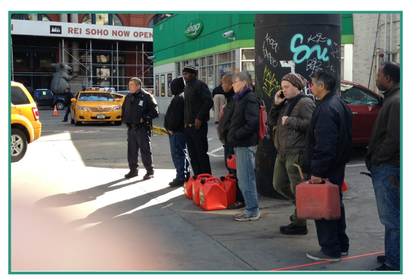
▲ Police Regulate Gas Lines.

The NYPD and other local law enforcement agencies were also critical in maintaining order at gas stations during shortages. When gas lines were at their peak, fights broke out throughout the region. Police were called in and made arrests. Eventually, police officers were placed at every gas station in the city to prevent fighting and regulate orderly lines.<sup>41</sup>