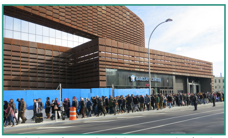
A Riders line up for Bus Bridge vehicles to transport them from the Barclays Center in Brooklyn to Midtown Manhattan.

While a major gas shortage and long-term closures of key arteries would have led to a prolonged crisis in a more autodependent city, New York was able to leverage alternative