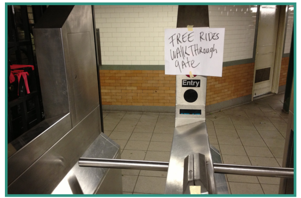
▲ Subway Rides Free in the Days After the Storm.

On Wednesday, October 31, Governor Cuomo and the MTA announced that subway service would resume the following day, primarily north of 42nd Street in Manhattan and into the Bronx, east of downtown Brooklyn and Williamsburg, and in parts of Queens. The F and N trains (between Manhattan and Queens) were the only trains crossing the East River, which created massive crowding issues. Limited Metro-North service between Grand Central and White Plains began, and limited Long Island Railroad service between Jamaica Station and Penn Station and Atlantic Terminal resumed as well.<sup>17</sup> The MTA worked tirelessly