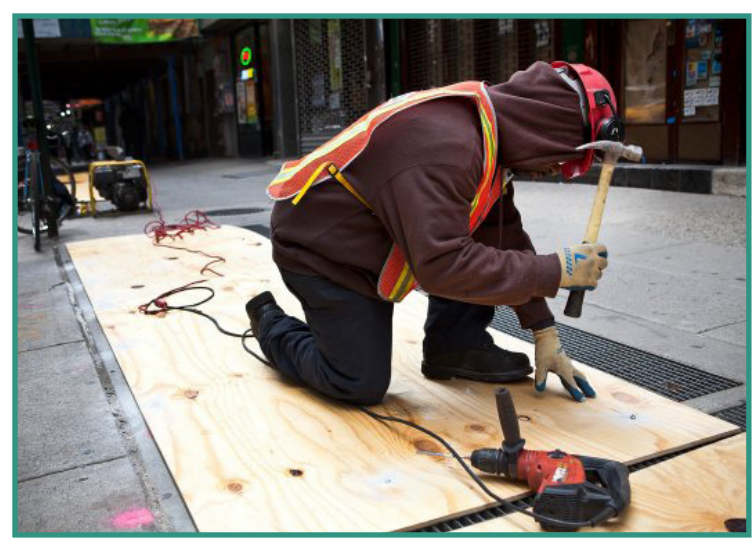
▲ MTA worker covering subway ventilation grate