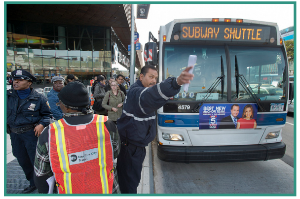
▲ Loading Buses at Atlantic Avenue.

You had issues everywhere, you had no subways coming across from Brooklyn to Manhattan, so we needed to set up a new surface subway system. We worked