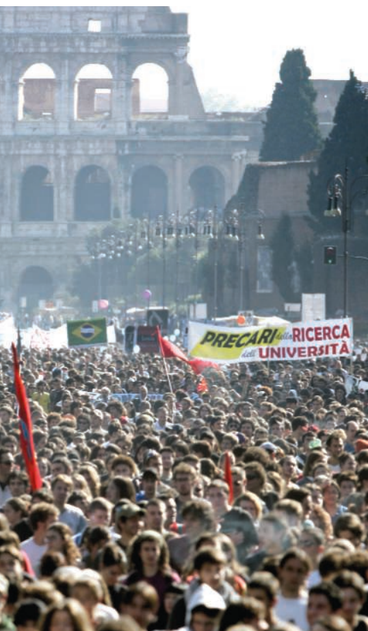
Researchers protest in Rome, 2005. Almost 100,000 participants protested the lack of concrete actions taken by the Senate to improve the conditions of research in Italy and to reduce the use of temporary contracts for researchers.

President, European Brain Research Institute, Via del Fosso di Fiorano 64, 00143 Rome, Italy.