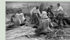
Central New York was the center of willow cultivation in the early 1900's for the historic basket-making industry.