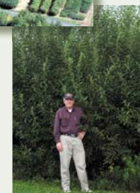
Two-year-old willow shrubs