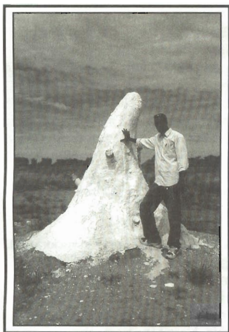
Termite mound covered with plaster or paris for research purposes (P. Cunningham)

Everyone who travels through northern Namibia has seen them: termite mounds topped by gnarled fingers of dried mud pointing to the northern sky.