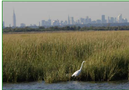
The Gateway National Recreation Area at Jamaica Bay, despite its location in an ultra-urban environment, is a nationally and internationally renowned birding destination.

For thousands of years, Jamaica Bay has served as an important ecological resource for flora and fauna. The Bay has evolved over the last 25,000 years as an important and complex network of open water, salt marsh, grasslands, coastal woodlands, maritime shrublands, brackish and freshwater wetlands. The wildlife use of these systems is commensurate with this complex network of natural systems. These natural communities support 91 species of fish, 325 bird species (of which 62 are confirmed to breed locally) and are an important habitat for many species of reptiles, amphibians and mammals. The Bay is a critical stopover area along the Atlantic Flyway migration route and is one of the best bird-watching locations in the western hemisphere. The 20,000 acres of water, islands, marshes, and shorelines support seasonal or year round populations of 214 species of special concern, including state and federally endangered and threatened species.