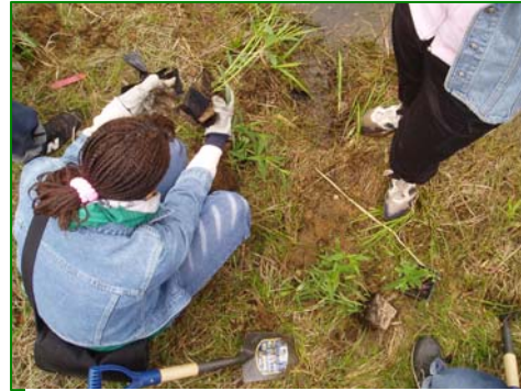
Encouraging Stewardship.

chemicals, and promote sound landscaping practices.