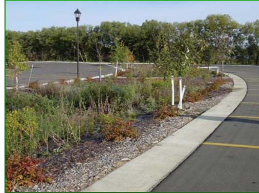
Vegetated swale installed in road median.