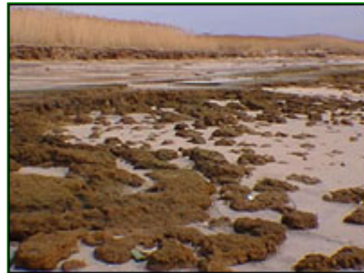
Existing upland marshes and dunes of Jamaica Bay, Source: Don Riepe.

Beaches and dunes are important natural buffers against the forces of wave and wind erosion, and are dynamic landscape features that quickly change as a result of wind erosion and deposition. These areas support several rare plant species, serve as vital foraging and breeding habitat for selected birds and aquatic organisms, and provide aesthetic and recreational opportunities for residents and tourists. In coordination and collaboration with multiple agencies and environmental groups, NYCDEP will update an inventory of all existing dune and beach habitats to create a base GIS map. This information can be then used by restoration practitioners in developing and leveraging future ecological restoration designs.