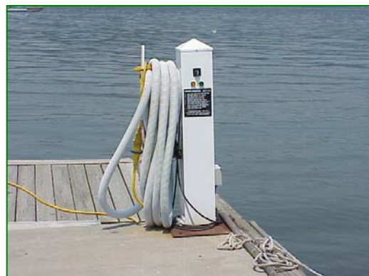
A boat pump-out unit installed in 2000 located at the Coney Island WPCP, Source: NYCDEP Boat Pump Out Remote Unit.

Personal watercraft in Jamaica Bay sometimes “pump-out” wastewaters directly into the Bay. This water contains high concentrations of pathogens and other pollutants associated with human waste products. To help improve water quality and provide an important free service to local area boaters, using matching funds from the Clean Vessel Act program, NYCDEP has installed two pump-out facilities on Jamaica Bay. NYCDEP is currently developing the designs for a third facility at the Rockaway WPCP and is obtaining required NYSDEC permits. NYCDEP will continue to explore a potential additional location for a fourth boat pump-out station, which would allow for designating Jamaica Bay as a “No Discharge Zone” for boaters.