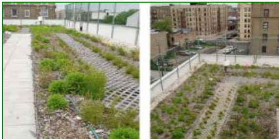
One of Gaia Institute's green roof projects in the New York City area.

As BMPs become more widely used and as contractors and developers incorporate more BMPs into their developments, lessons will be learned, cost efficiencies will be identified, and economies of scale will be accrued. It is NYCDEP's hope that the Implementation Strategies suggested in this Plan, from the many pilot studies that will be conducted to the code reviews and the incentive programs that will be explored, will help lay the groundwork for more widespread acceptance of BMPs in New York City.