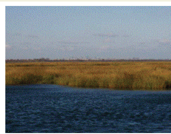
Submitted by the Jamaica Bay Watershed Protection Plan Advisory Committee