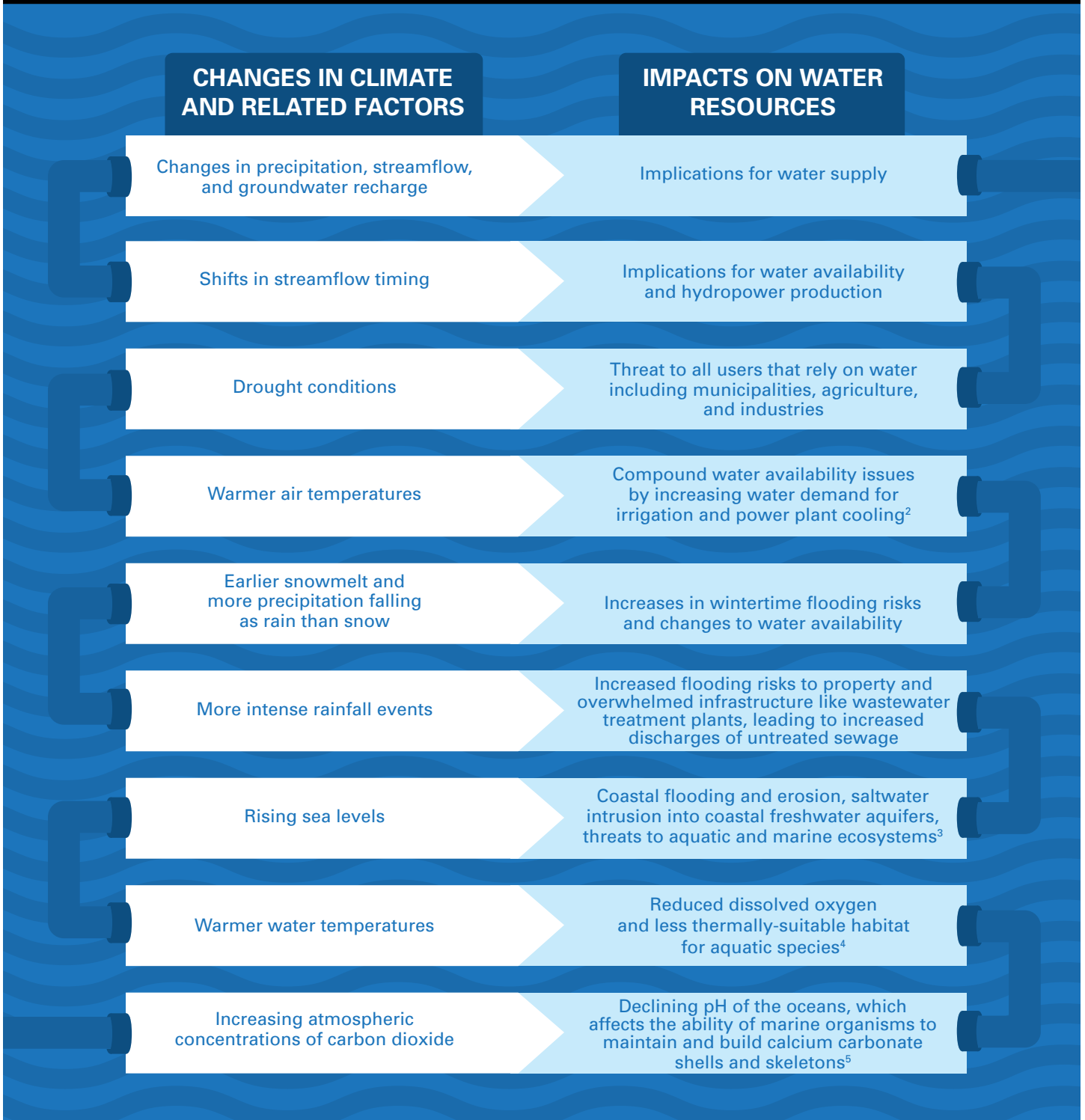
Figure ES-1: Water-related impacts of climate change