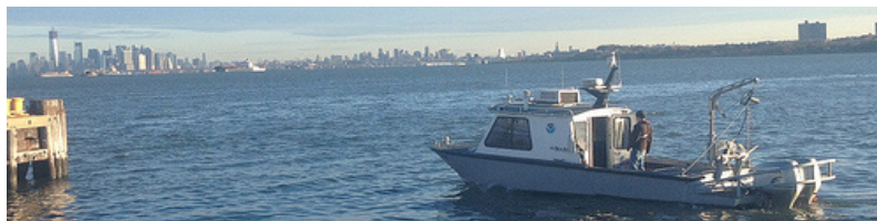
NOAA Coast Survey's Navigation Response Team 5 starts their surveys from Sandy Hook Pilot base.

As the communities impacted by the storm begin long-term planning, NOS stands ready to carry out additional activities including navigational surveys; coastal inundation modeling; assistance with planning for sea level rise; and providing communities with a range of technical expertise as they plan for future storms.