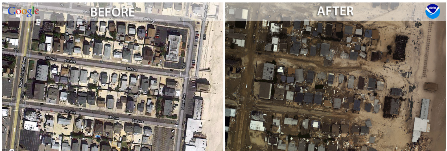
Before-and-after images of the storm's destruction along the New Jersey coastline.