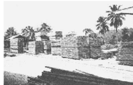
Degradation of wood products due to attack by decay fungi and insects is an ever-present hazard in the tropics. Construction lumber imported into Puerto Rico is treated with wood-preserving salts and then stacked for air drying.

Copies of Agriculture Handbook 607 are available from: U.S. Department of Commerce National Technical Information Service (NTIS) 5285 Port Royal Rd. Springfield, VA 22161 Order No.: PB85-156917 Cost: $86.50 + $5 S&H (U.S.); $174 + $10 S&H (non-U.S.) Phone: (800) 553-6847