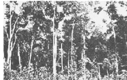
Planalto forest in Rio Curua-Una region, Brazil. About 60 percent of the volume is in species considerably denser than U.S. commercial woods (basic specific gravity over 0.70).

increase the demand for more adequate scientific and technical data on these woods and their applications.