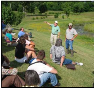
Working Group members learn about the Creek

The Working Group meets at 5:30pm on the first Wednesday of each month. Meetings are open to the public. For a meeting schedule and location please visit www.esf.edu/onondagacreek .