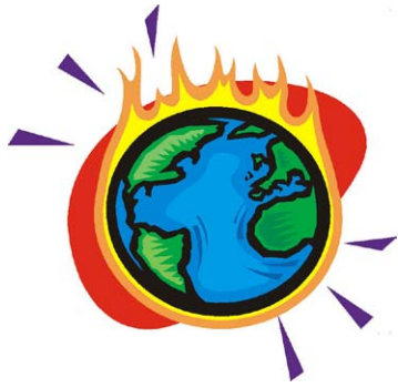
Environment on the Edge