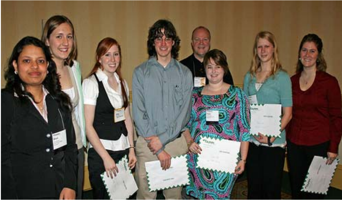
Figure 3: TAPPI/PIM Scholarship Winners, 2009.

Funding: Joachim Fellowship (50%) and TAPPI/PIMA Travel Award, 2009 (45%), CSTEP (5%).