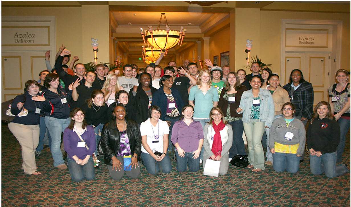
Figure 2: TAPPI/PIMA Student Summit, 2009.

The 2009 Student Summit was held on January 17-19, 2009, at the Sandestin Resort, Destin, Florida, where a record number of 110 paper and chemical engineering students attended representing a majority of the US Paper schools. TAPPI Student summits had been a great opportunity for the paper schools students to network as well as get educated about the real world scenario of the paper industry job sector. It was a wonderful experience for a foreign student like me to be informed about many aspects of the Paper Industry in the North American region, its current trends, future direction of the industry, etc. At the same time it had the following sessions, which increased my skills in networking, interviewing and how to cope with the transition to face at the work place.