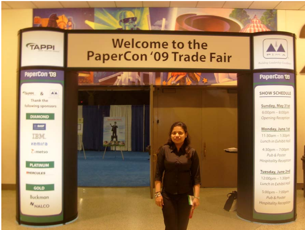
Figure 4: PaperCon'09.

The most remarkable achievement of this particular conference was being selected as a board member of the first ever Young Professionals Committee of TAPPI. I am the only person to represent SUNY ESF in this board and had been actively involved in it ever since. The vision and mission statement of this committee had been proposed by me and I am in charge of forming the handbook for this committee. I have also been chosen to moderate the first ever session of PaperCon,2010 for students/young professionals. This had been a great opportunity to step into a leadership position, understand about organizational development and a great way of networking with the students and professionals of many other universities, TAPPI professionals and Couch pit university members.