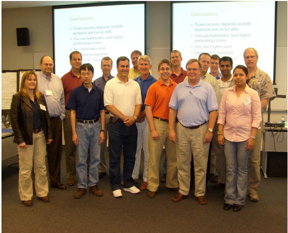
Figure 1: CPBIS Trainees,2008.

This week long intense training provides the participants with the tools and skills that they need to solve any management related problems in the industries. This is a life long sustaining training that can be used in any industry at any level in the career of the participants.