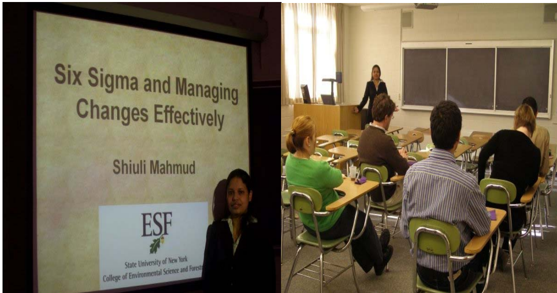
Figure 5: Seminar Day.

6) GPA: The fellowship recipients were required to maintain a GPA above 3.0. I have maintained a cumulative GPA of 3.707 over the year after finishing all the required courses, which fulfills the basic requirement of the fellowship.