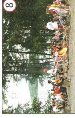
Pack Demonstration Forest

The wooded hills south of Syracuse provide a setting for field laboratory courses, research and demonstration throughout the year.