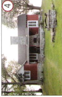
Thousand Islands Biological Station

This experiment station houses the College arboreta, greenhouses and a tree nursery, and contains both plantations and natural tree stands.