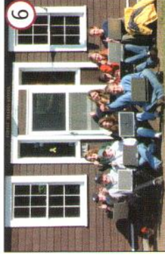
Cranberry Lake Biological Station

On the shore of the Oswegatchie River in the Adirondacks, SUNY-ESF's Ranger School offers the nation's oldest forest technology program.