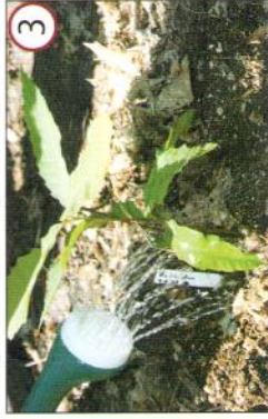
Lafayette Road Experiment Station