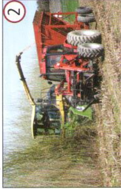
Tully Field Station

Accessible only by boat, this field station hosts an academic summer program and independent research projects by visiting scientists.