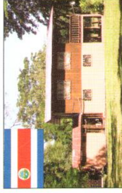
Costa Rica – Field Station

This forest is the home of the DEC's Environmental Education Camp and several miles of hiking trails, one of which is accessible to people using wheelchairs.