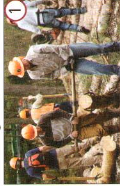
The Heiberg Memorial Forest

This facility comprises the Adirondack Ecological Center, the Adirondack Interpretive Center and the Northern Forest Institute.