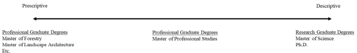
Figure 1a. ESF's Graduate Program Continuum

Assessing ESF's graduate programs is challenging given their prescriptive to descriptive nature as illustrated by Figure 1a.