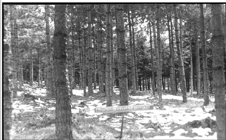
Photo point #29: 1915 Red Pine in 1936 (above) and after student logging in 2008