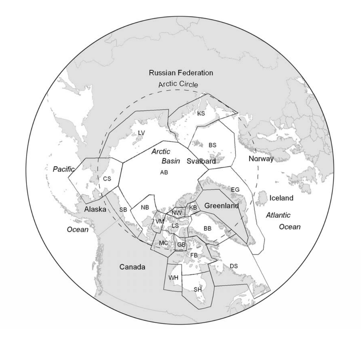
Figure 1. Distribution of polar bear populations throughout the Arctic circumpolar basin. CS=Chukchi Sea, BS=Southern Beaufort Sea, NB=Northern Beaufort Sea, VM=Viscount Melville Sound, NB=Norwegian Bay, LS=Lancaster Sound, MC=M'Clintock Channel, GB=Gulf of Boothia, FB=Foxe Basin, WH=Western Hudson Bay, SH=Southern Hudson Bay, KB=Kane Basin, BB=Baffin Bay, DS=Davis Strait, EG=East Greenland, BS=Barents Sea, KS=Kara Sea, LV=Laptev Sea, AB=Arctic Basin