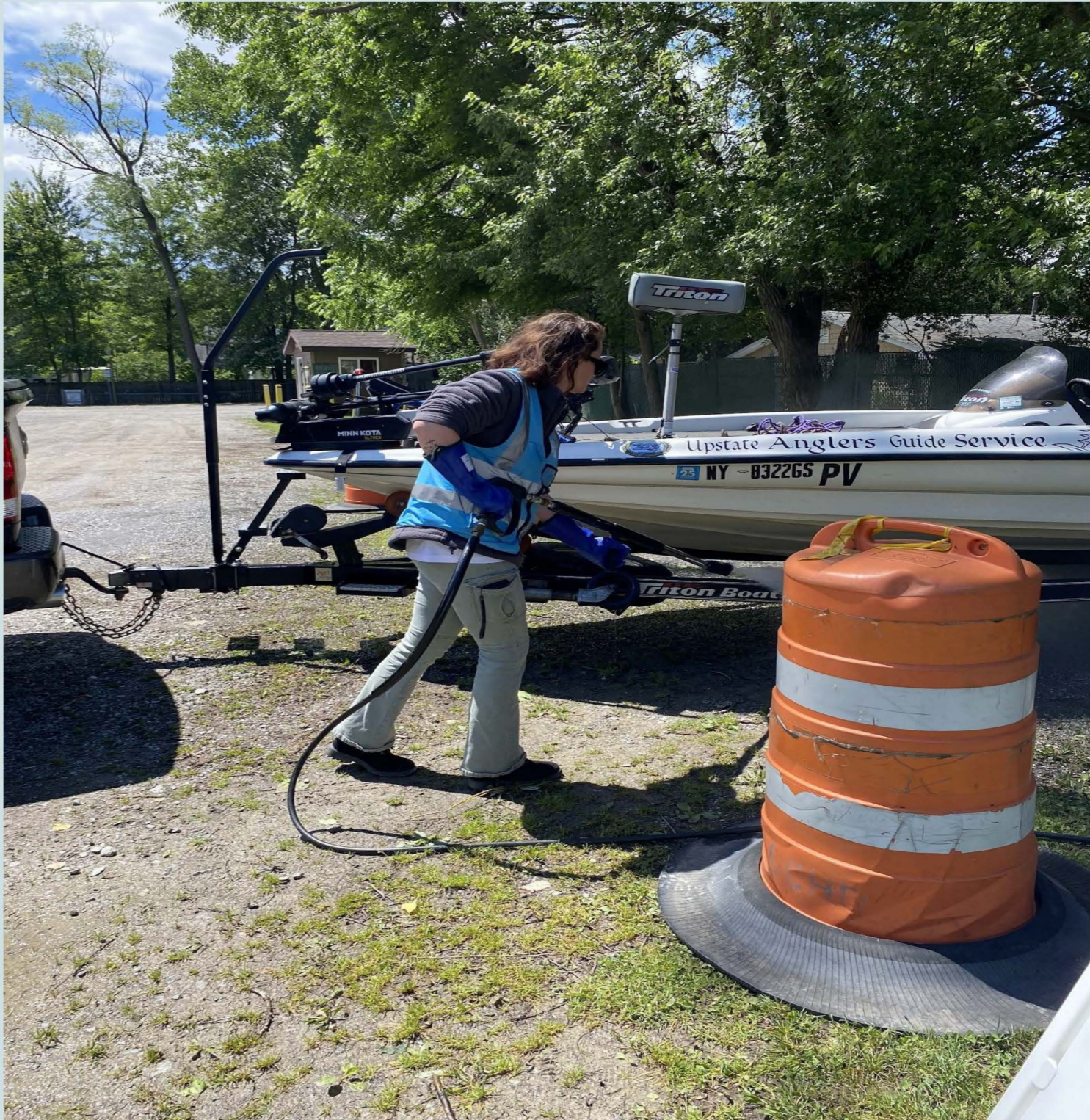
2024 steward Tempy performing a watercraft decontamination