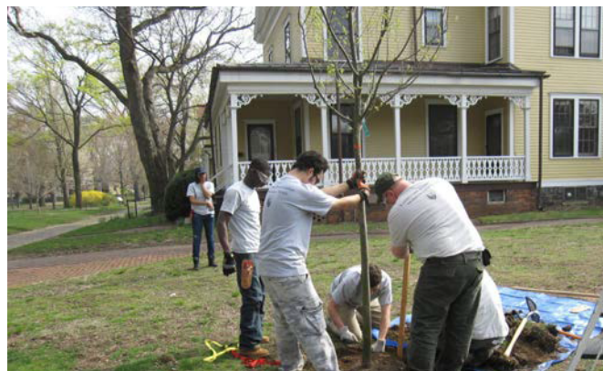
Top: Catherine Murray House, Syracuse Land Bank (demolished 2020) Tree replanting, Governor's Island National Monument

LSA 581 is a 3 credit course that meets T/TH, 9:30-10:50, location: 315 Bray Hall