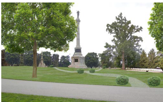
Top: The Sylvester historic rehabilitation, Syracuse Bottom: Rehabilitation simulation, Gettysburg National Cemetery