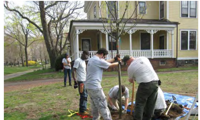
Top: The Sylvester historic rehabilitation, Syracuse