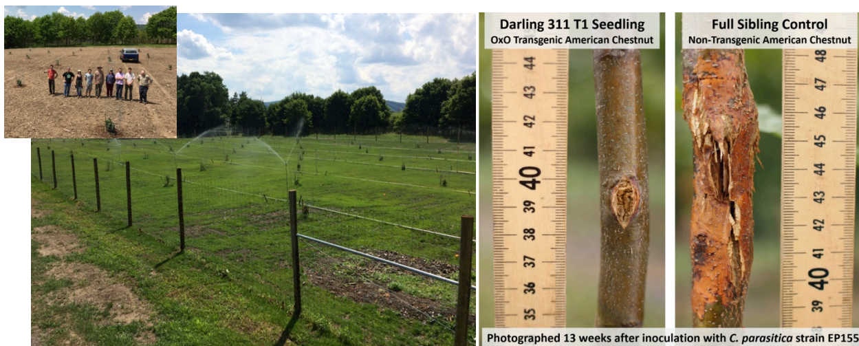
Figure 1. Left + inset: New seed production orchard being established, Tully, NY. Right: inoculated stems showing blight resistance we expect to be inherited by seedlings in these orchards. These are sibling offspring of older 'Darling' events, both of which were infected with the blight fungus. Trees expressing the OxO gene have high levels of blight resistance, as demonstrated by the seedling on the left, compared to the one at right, which did not inherit the OxO gene.

Seed orchards of the blight resistant American chestnut trees and wild-type mother trees are being established in three phases (Fig. 1, left), with this year being the first phase. Both transgenic trees and wild-type mother trees will be multiplied, rooted, acclimatized, greenhouse grown, and planted in orchards located at Tully and Zoar Valley, New York. The orchards will be fenced to protect from deer, and irrigated to optimize growth. The plantings will be designed to optimize intercrossing between a lead transgenic event (Darling 54 or Darling 58) and an American chestnut mother tree line (Ashale or Zoar). Due to expected inheritance patterns, about half the nuts produced from these orchards will produce fully blight resistant trees (Fig. 1, right). The orchards will be expanded over the next three growing seasons, pending continued funding. Once we complete the regulatory review and receive approval for distribution, these orchards will provide the nuts to grow seedlings for the public and for restoration of this important tree.