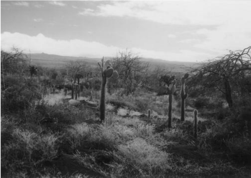
Plate 2 Habitat at the site where a population of the Santiago rice rat Nesoryzomys swarthy was discovered.

addition to Santa Cruz, in the Galápagos on which both a large and a small form of rice rat occur, and now the only island where sympatric species of native rodents are extant. This will allow the possibility of future ecological studies regarding niche subdivision in Nesoryzomys .