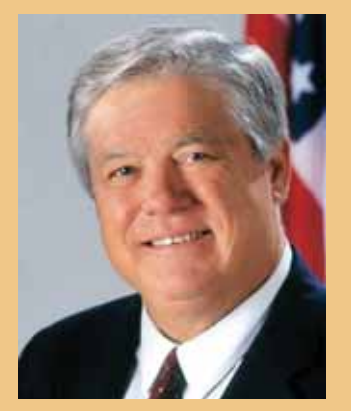
Governor Haley Barbour, Mississippi