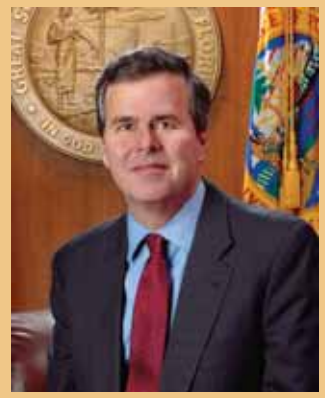
Governor Jeb Bush, Florida