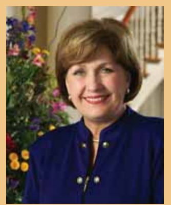
Governor Kathleen Blanco, Louisiana