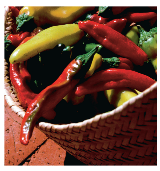
Some of 60 different chili varieties richly diverse in color, shape, size, and heat grown at the Conservation Farm in Patagonia, Arizona.