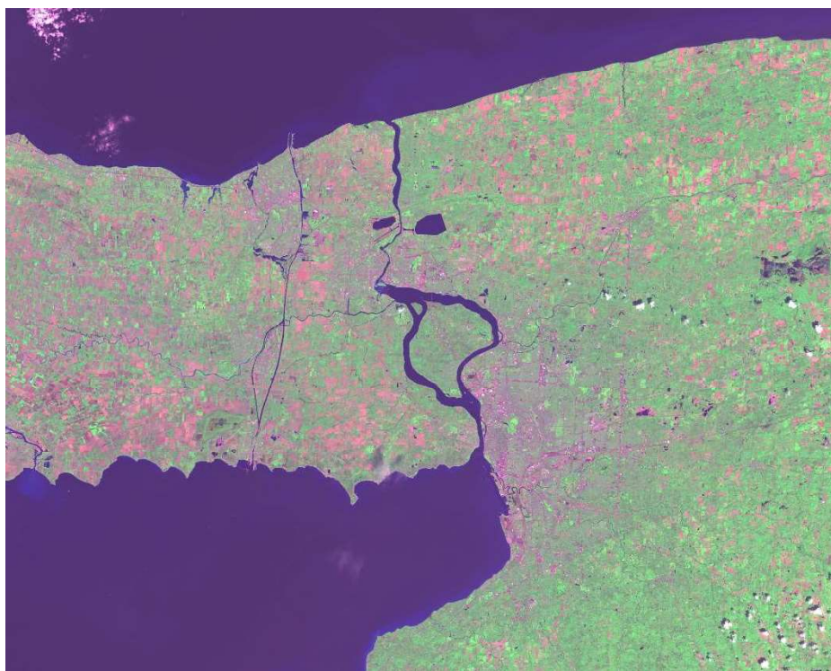
Landsat 8, Path 17, Row 30, Band 7, 5, 3

Area near Lake Ontario, Buffalo, and Lake Erie, on February 17, 2014. These images are composited by shortwave infrared, near infrared, and green band. Lake Ontario is deep blue but Lake Erie is white because it was covered by ice and snow. Two reservoirs along Niagara River and most land appear as white as well.