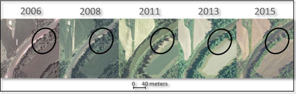
An example of NAIP images showing riparian vegetation conversion into agricultural land use in Alleghany County, NY.

product. Several factors influenced these differences, including detection of higher order streams, land use, and riparian zone width. The procedure developed in this study can enable the holistic quantification of riparian vegetation delineation accuracy for both channel boundary delineation and vegetation classification.