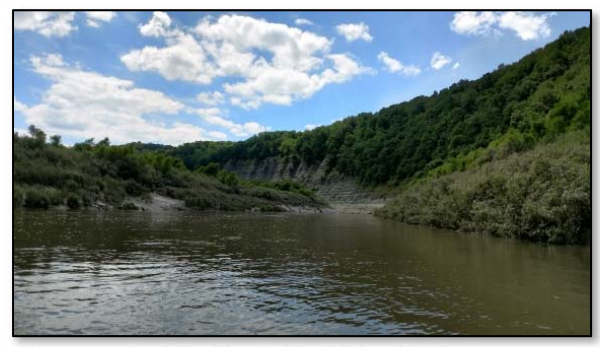
The reservoir of the Mount Morris Dam in the Genesee River in Letchworth State Park.

NYView initially focused on facilitating access to diverse remote sensing data and products, and supporting collaborative research, teaching, and outreach among consortium members. Since becoming a full member of AmericaView in 2014, NYView has also supported training of high school teachers, undergraduate and graduate students, and used Landsat change pairs from sites across the state to demonstrate applications of remote sensing data for visitors at the New York State Fair. NYView has also invested