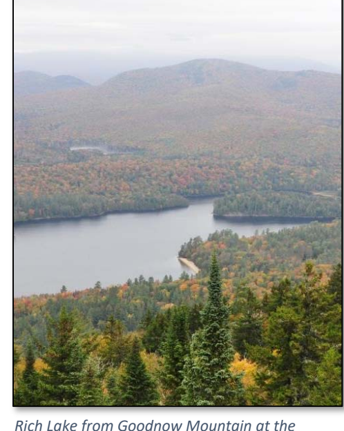
Rich Lake from Goodnow Mountain at the Adirondack Ecological Center in Newcomb, NY Google Earth Engine platform.

Beyond the important education focus described above, NYView has also performed research that explored the integration of airborne lidar and Landsat data to quantify forest aboveground biomass as well as investigating the utility of remote sensing and spatial analysis to assess trends in vegetation extent and vigor along riparian corridors.