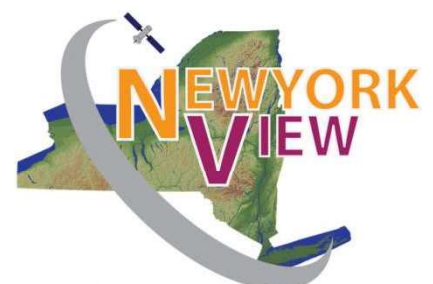
Landsat 8, Path 16, Row 30

This is Lake Ontario's data acquired on April 02, 2015. Most of the places is covered with ice and there is no sign of plant growth. 2015 had a much colder April than 2010.