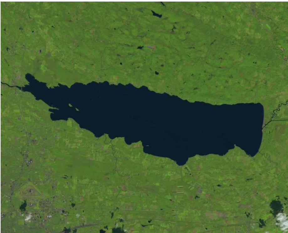
Landsat TM, Path 15, Row 30

This is the image of Oneida Lake acquired on September 18, 2015. There is no visible Algal Bloom from the remote sensing image. The lake became clearer than it was in 1992.