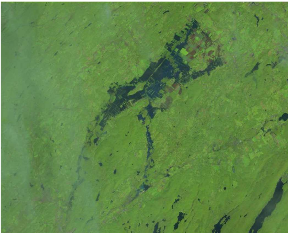
Landsat 5, Path 14, Row 31, Band 3, 2, 1

In August 31, 2011 after Hurricane Irene, this image clearly shows the Wallkill River flooded over their banks. These darker tones suggest potential flood damage to the crops in this region. Landsat images can be an important tool for monitoring damage to agriculture and help to make recovery plans.