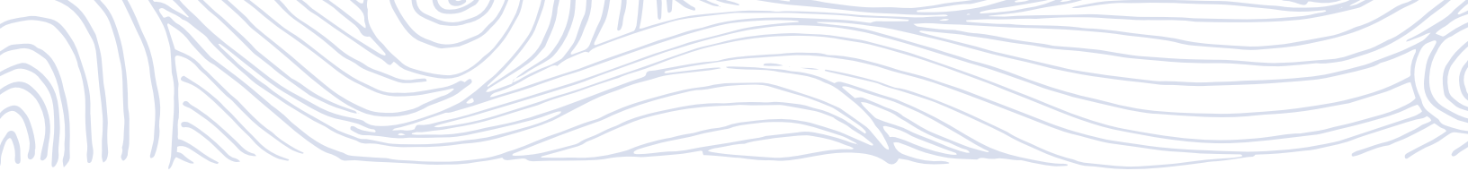
Table of Contents cont.