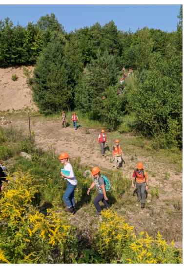
New York State Ranger School Alumni Association Keep in Touch