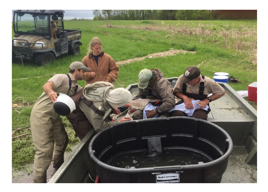
TIBS and USFWS combine forces with NYS DEC in program to study restoration of muskellunge spawning populations follow losses associated with VHS disease outbreaks and introduction of Round Goby in the mid-2000s. Photo: Eggs are stripped from a female St. Lawrence River Muskie and cultured fry and fingerlings are released in a multi-year study to assess population enhancement in the Thousand Islands Region.