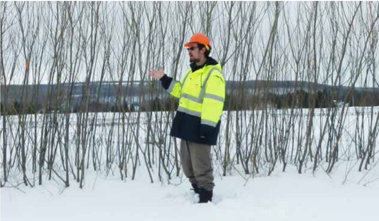
Fig.1: A shrub-willow living snow fence in New York State just four years after planting with height and branch density sufficient to create snow storage capacity thirteen times greater than the average annual quantity of blowing snow transport at the site.

The high branch density and rapid height growth of SWLSF provide the two vegetation characteristics most critical to snow trapping and storage. A recent study conducted by researchers at the State University of New York College of Environmental Science and Forestry (SUNY-ESF) has shown that the growth trends of SWLSF can create sufficient snow storage capacity for an average winter in most locations across New York State just three years after planting when best management practices are employed (Figure 1). A suite of critical best practices for SWLSF have been developed by SUNY-ESF to ensure this level of rapid functionality, long term survival, and maximum return on investment. These practices (which can also be applied to living snow fences of other vegetation types) include plant selection, site preparation, planting techniques, weed control, and integrated pest management.